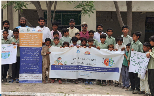
CELEBRATING WORLD ENVIRONMENT DAY WITH THE COMMUNITY.